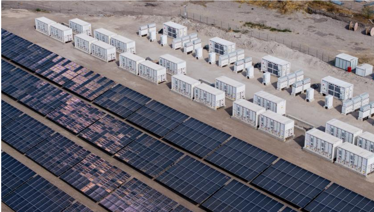
Hybrid Project Pernik | 30 MW Solar + 32 MW/61 MWh BESS